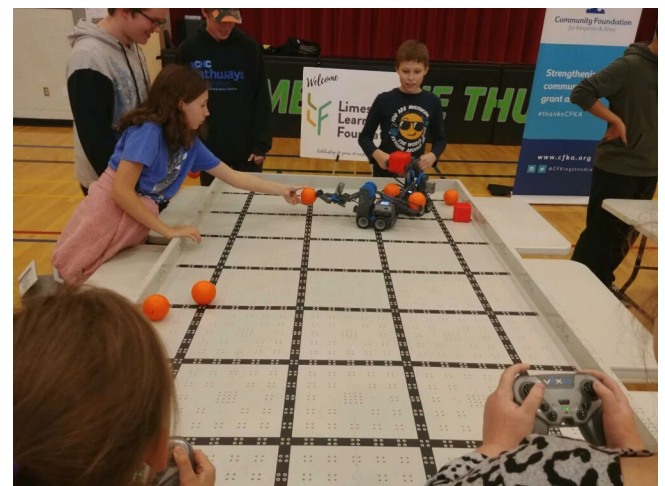
Robotics Club kickoff at Molly Brant Elementary School. Students participated in various VEX and robotics challenges.

Thank you for funding this project Community Foundation for Kingston & Area