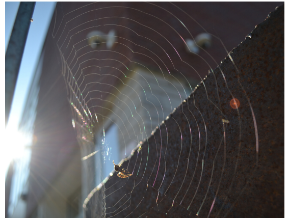
Emily Conner, Grade 11

Three students from the media arts class found beauty in nature while exploring camera settings.